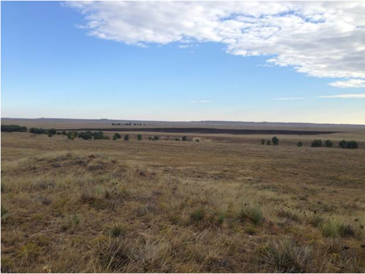
Above: Long distance shot from the Slayton ridge of the wildfire burn area.