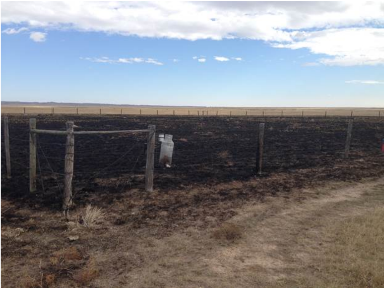
Above: The grazing enclosure in 1W following Friday's wildfire.

On behalf of the USDA-ARS-Rangeland Resources Research Unit, I thank you all for your continued participation in this project.