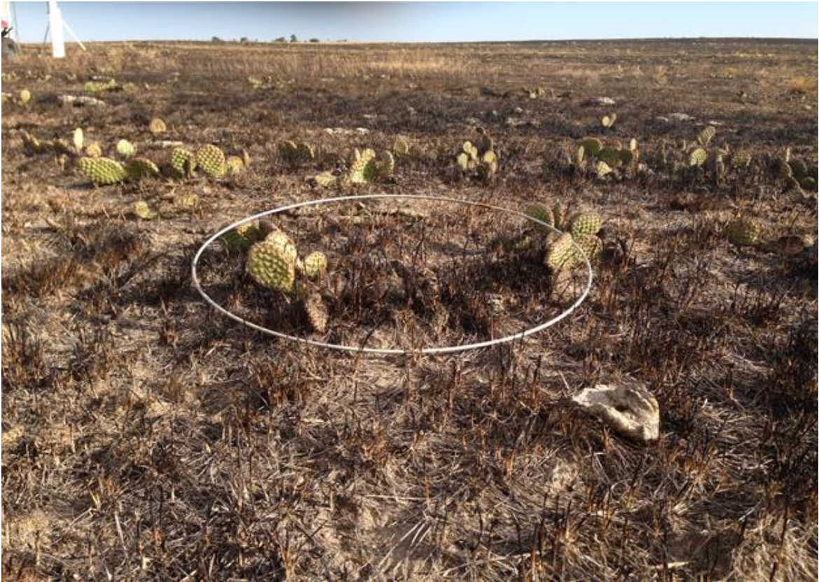
Above: A close-up of the burn area.